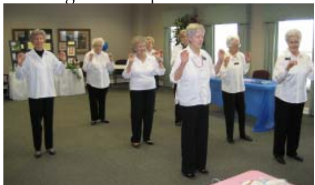
(The Mostly Silver Liners)

Entertainment was provided by the Epworth Villa line dancers The "Mostly Silver Liners." The event gave residents and visitors a chance to see all that Epworth Villa and the Oklahoma City community have to offer related to fitness and wellness.